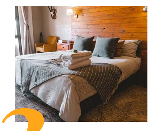
Accommodation Hospitality and luxury