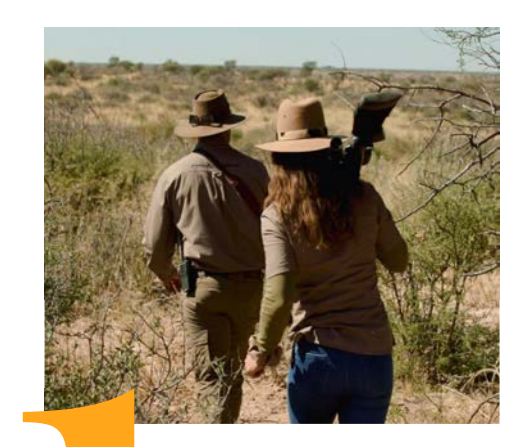
Hunting & Namibia What you can expect

We offer the hunter a large selection of species in a variety of different areas in Namibia, on a huge private game ranch and wide-open free-range concession.