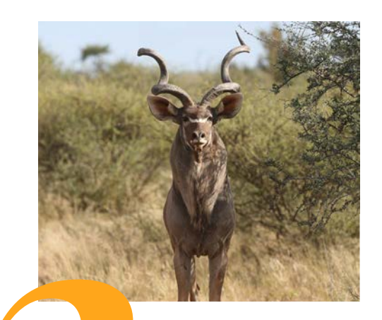
and Daily / Specie Rates